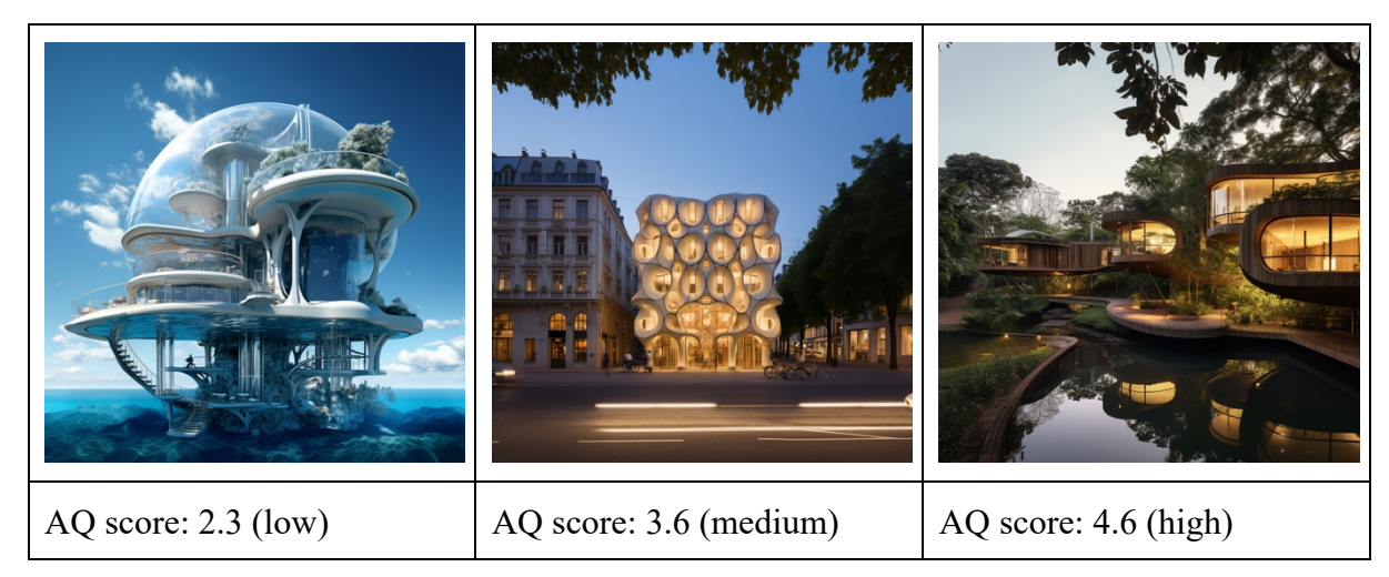
Figure 2. Examples from images with the lowest, medium, and highest AQ scores

Regarding descriptive language (DL), high-quality images' prompts contained an average of 9.46 and a median of 9 descriptive words, while medium-quality images had an average of 7.85 and a median of 7 words. The low-quality ones contained an average of 4 and a median of 3 descriptive words. A meaningful difference was detected between the descriptive words used in high-medium and low-quality images, while the difference between the high and medium quality is slighter (Table 1).