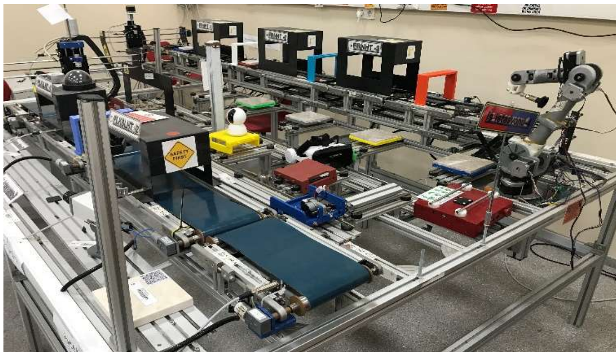
Figure 2. Smart Factory Model (AFSUAM)

Animation of the conveyor belts and heat process is shown on the SCADA interface.