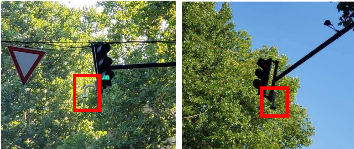
Figure 2. Vehicle detectors installed next to the traffic lights at the intersections