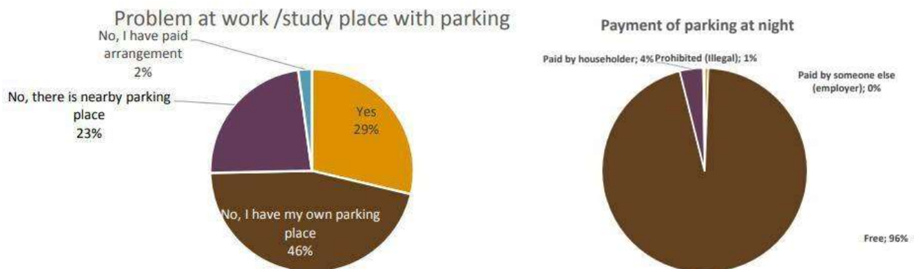
Figure 3.

Parking is an acute challenge for the city of Tbilisi. After the collapse of Soviet Union, the urbanization degree of Tbilisi went and is still going up and up. At the same time, there exists no clear transportation strategy, that includes parking in particular; Until late 2010s city hall officials did not use proper parking strategy as a mean to manage congestion and encourage public transport usage over personal vehicles (Tbilisi SUTs, 2015). Until recently parking was free of charge anywhere in Tbilisi; sidewalks were and still are crowded by vehicles everywhere in the city. The study “Consulting Services for Organization of a Transportation Household Survey in Tbilisi Metropolitan Area” conducted in 2016 by Systra LLC shows, that 29%, almost 1/3 of drivers have problem of parking at work/study areas. The study also illustrated that 96% of all city parking is completely free at night.